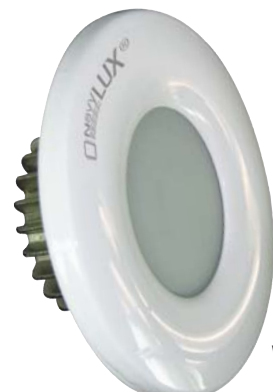
WHITE ENAMEL Ref.: 3020-3

Designed and produced by : Selectronic 59790 RONCHIN • FRANCE • www.selectronic.fr