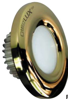
BRASS finish Ref.: 3020-1