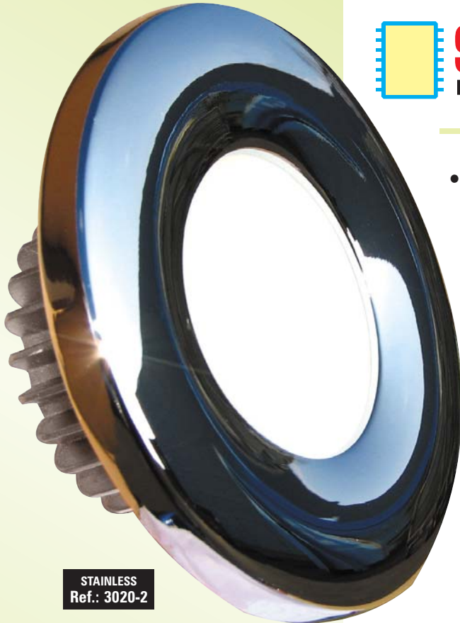
STAINLESS Ref.: 3020-2

4W power consumption equivalent to a 30W halogen lamp