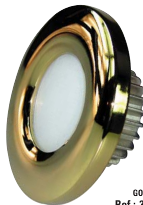
GOLD Ref.: 3020-1