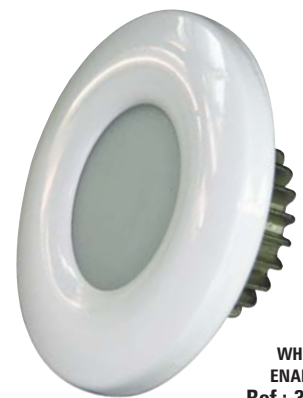
WHITE ENAMEL Ref.: 3020-3