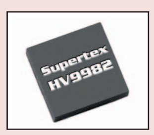
40-Lead QFN (K6)