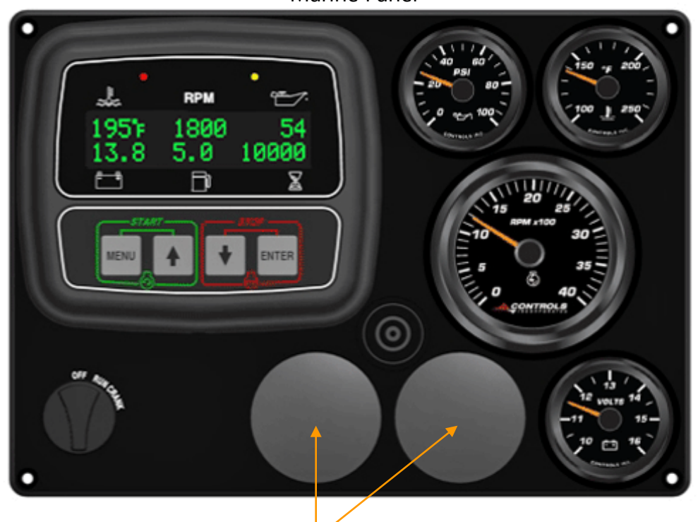
Optional transmission pressure and temperature gauges