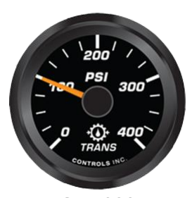
GEM028 Transmission Pressure